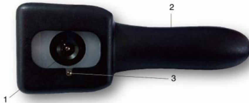
Instrument head structure diagram

1- camera and infrared LED 2- handle 3-Orientation mark