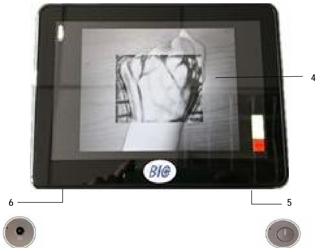
Instrument body structure diagram

4- Display screen 5 – power switch 6 – charging port